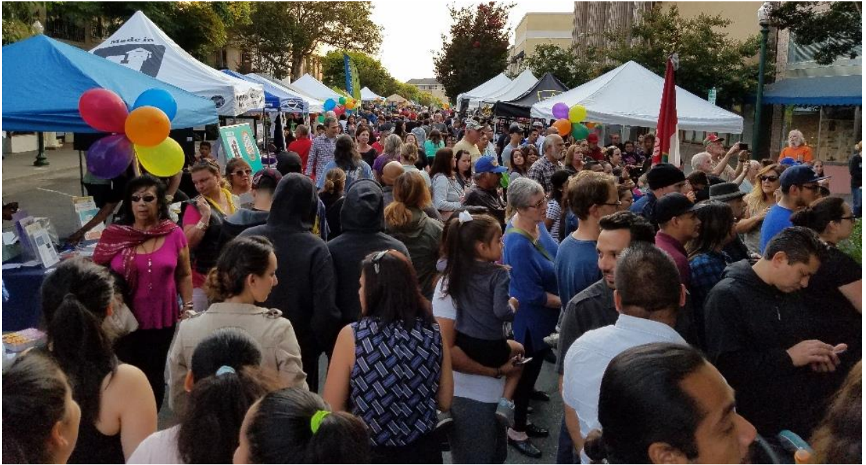
Downtown Hayward street party crowd